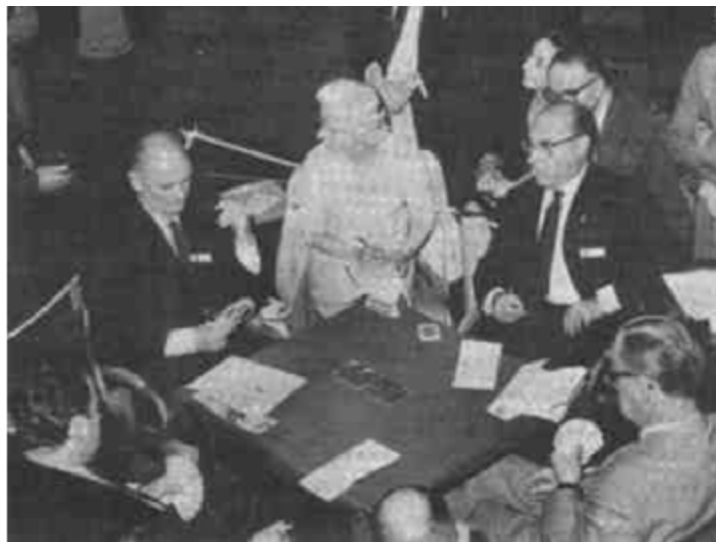
Terence Reese, left and Boris Schapiro, far right in Buenos Aires